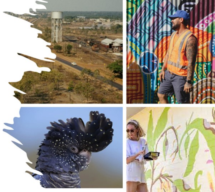
Artist in Residence 2022

Paint a mural which represents Parap Primary School's heart.