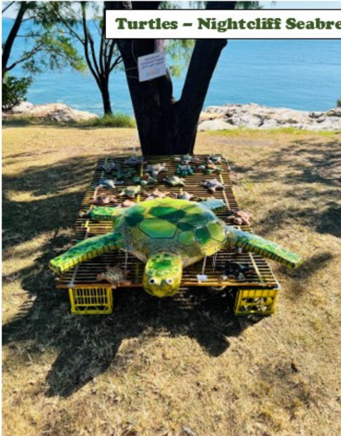
Turtles – Nightcliff Seabreeze Festival / New home at PPS