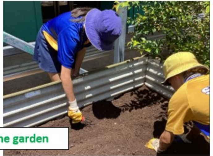
Our Eco Gardening Team preparing the garden